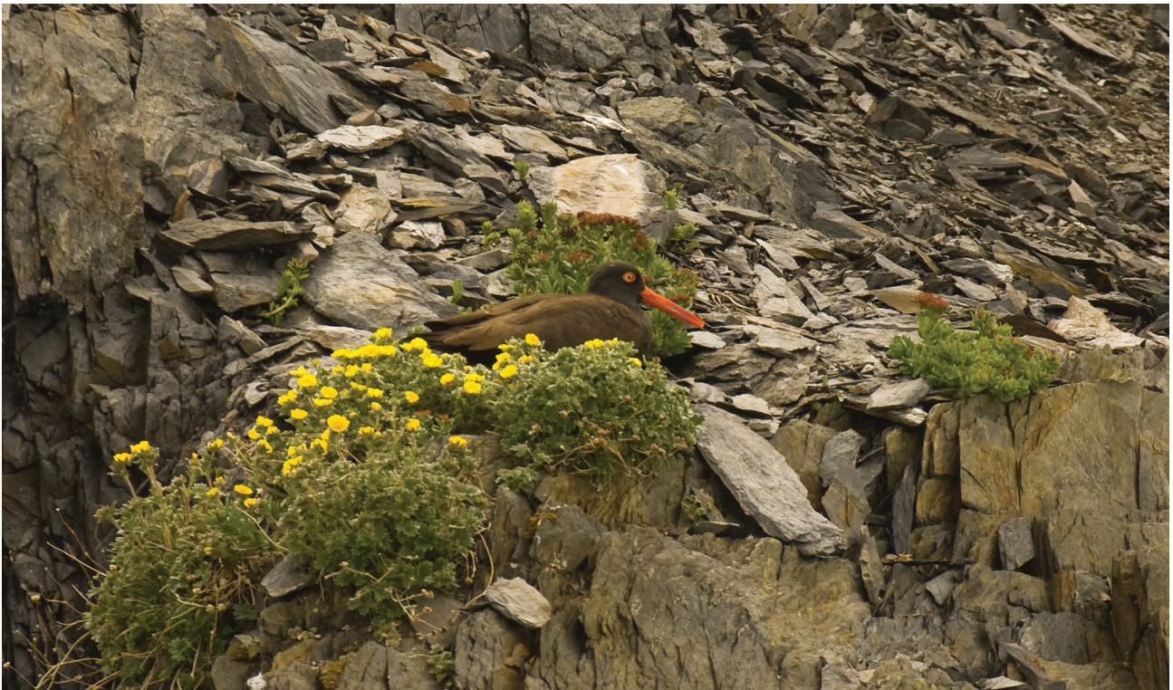
Black Oystercatcher on nest, Alaska, June 2005.