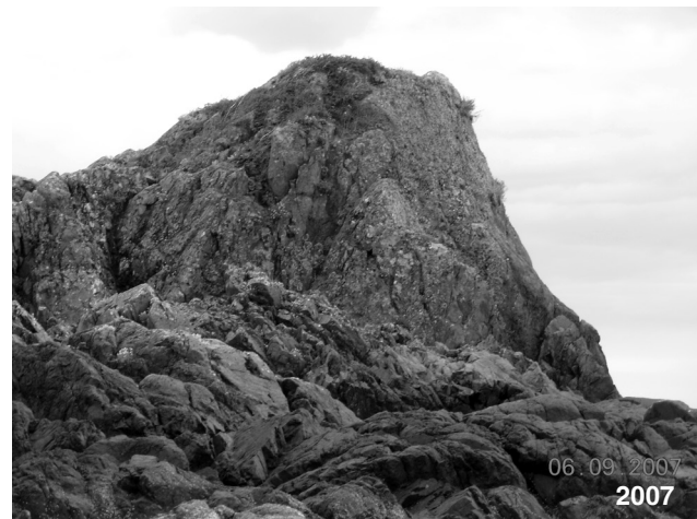
Fig. 2. Example of lack of plant succession on rocks used by Black Oystercatchers nesting in Sitka Sound, Alaska. Images were taken at the same site in 1940 and 2007 from different angles.

do not believe that vegetation succession on nest rocks had eliminated nest site potential (see Fig. 2 for an example).